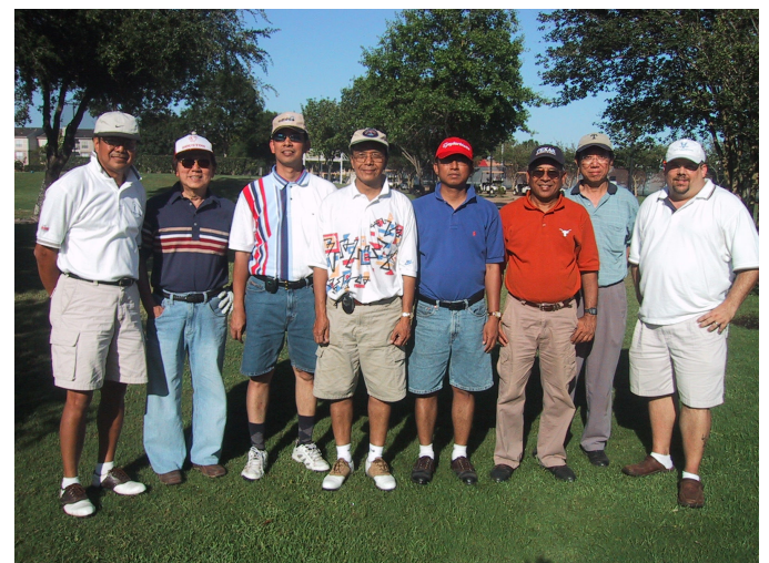
Golfers from 2006 BAAT Golf Classic

BAAT Membership Dues: Annual Membership Dues will be collected at the picnic. For those who have not paid membership dues for 2006, you will have the opportunity to pay them to reinstate your membership. Members are not required to pay past dues for the years before 2007. Dues